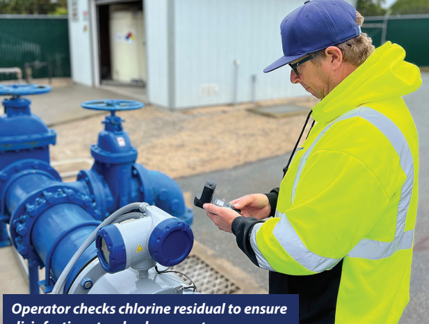
disinfection standards are met.

and other household activities. Compared to radon entering the home through soil, radon entering the home through tap water will in most cases be a small source of radon in indoor air. Radon is a known human carcinogen. Breathing air containing radon can lead to lung cancer. Drinking water containing radon may also cause an increased risk of stomach cancer. If you are concerned about radon in your home, test the air in your home. Testing is inexpensive and easy. You should pursue radon removal for your home if the level of radon in your air is 4 picocuries per liter of air (pCi/L) or higher. There are simple ways to fix a radon problem that are not too costly. For additional information, call your State radon program (1-800-745-7236), the U.S. EPA Safe Drinking Water Hotline (1-800-426-4791), or the National Safety Council Radon Hotline (1 800-767-7236).