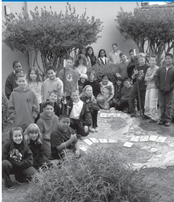
Olson Elementary School 4th graders participate in an art and water conservation project by making tiles lining a pond that depicts a watershed.