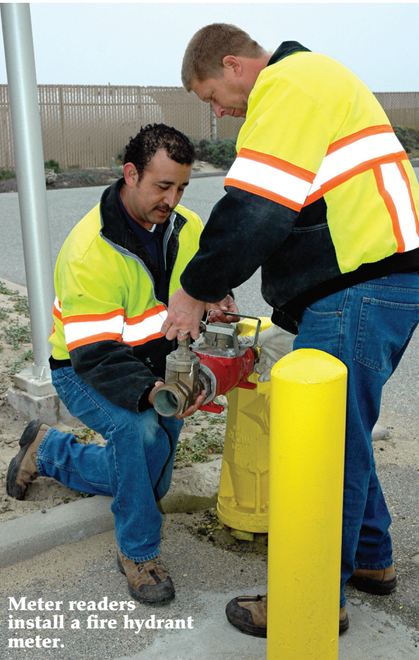
Meter readers install a fire hydrant meter.

Full details of the assessment may be viewed at the following locations: MCWD, 11 Reservation Road, Marina, CA, or at CDPH, 1 Lower Ragsdale Drive, Building 1, Suite 120, Monterey, CA.