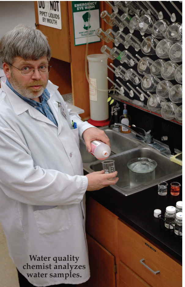
Water quality chemist analyzes water samples.

To ensure that tap water is safe to drink, the US Environmental Protection Agency (USEPA) and CDPH prescribe regulations that limit the amount of certain contaminants in water provided by public water systems. CDPH regulations also establish limits for contaminants in bottled water that must provide the same protection for public health.