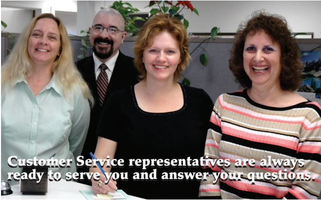
Customer Service representatives are always ready to serve you and answer your questions.