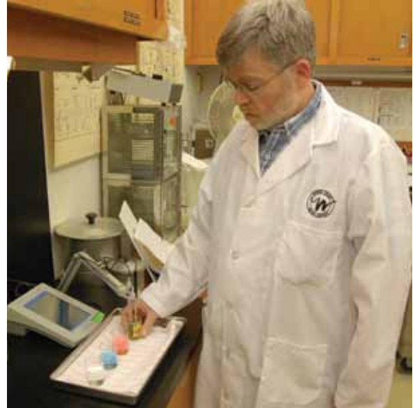
Water Quality Chemist analyzing a water sample

rinking water, including bottled water, may reasonably be expected to contain at least small amounts of some contaminants. The presence of contaminants does not necessarily indicate that water poses a heath risk. More information about contaminants and potential health effects can be obtained by calling the USE-PA's Safe Drinking Water Hotline (1-800-426-4791).