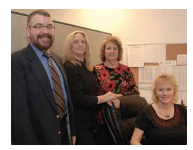
The MCWD Customer Service staff is available to assist you 8:00 a.m. to 5:30 p.m. Monday through Friday, excluding holidays.