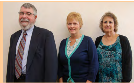
The District's Customer Service staff is available to assist you Monday through Friday, 8 AM to 5:30 PM.