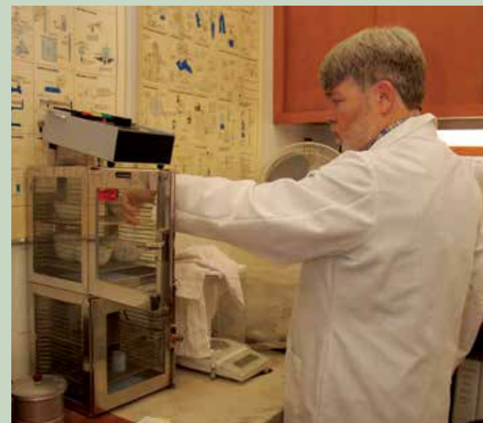
Laboratory staff continually monitor Marina's drinking water. Water quality data is posted monthly at www.mcwd.org .