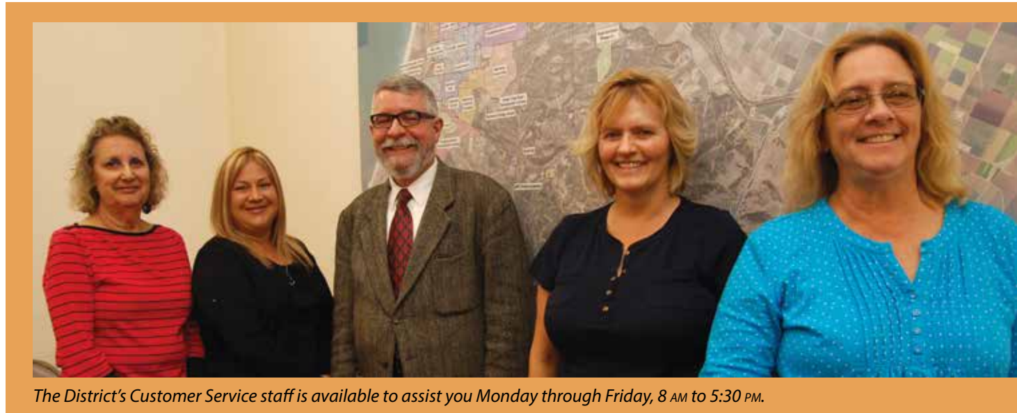
The District's Customer Service staff is available to assist you Monday through Friday, 8 AM to 5:30 PM.

Some people may be more vulnerable to contaminants in drinking water than the general population. Immuno-compromised persons such as persons with cancer undergoing chemotherapy, persons who have undergone organ transplants, people with HIV/AIDS or other immune system disorders, some elderly, and infants can be particularly at risk from infections. These people should seek advice about drinking water from their health care providers. USEPA/Centers for Disease Control (CDC) guidelines on appropriate means to lessen the risk of infection by Cryptosporidium and other microbial contaminants are available from the Safe Drinking Water Hotline (1-800-426-4791).