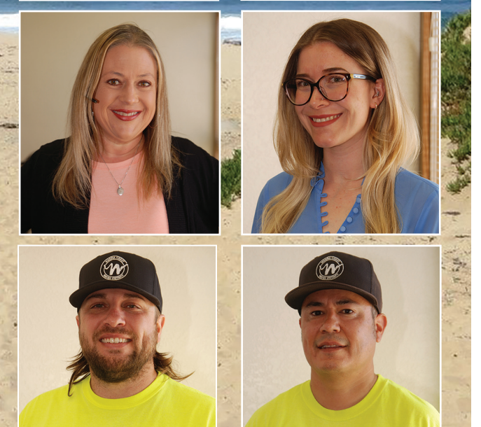
The District's Customer Service staff is available to assist you Monday through Friday, 8 AM to 5:30 PM.