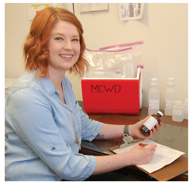
Preparing a water sample for analysis.

Radon is a radioactive gas that you cannot see, taste, or smell. It is found throughout the U.S. Radon can move up through the ground and into a home through cracks and holes in the foundation. Radon can build up to high levels in all types of homes. Radon can also get into indoor air when released from tap water from showering, washing dishes, and other household activities. Compared to radon entering the home through soil, radon entering the home through tap water will in most cases be a small source of radon in indoor air. Radon is a known human carcinogen. Breathing air containing radon can lead to lung cancer. Drinking water containing radon may also cause increased