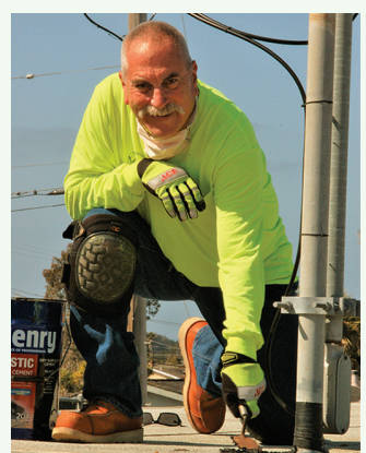
Regular maintenance at Well 10.

CA State Water Resources Control Board Division of Drinking Water Programs: waterboards.ca.gov/drinking_water/programs USEPA Division of Ground Water and Drinking Water: water.epa.gov/drink Centers for Disease Control: cdc.gov Fort Ord Cleanup Project: fortordcleanup.com