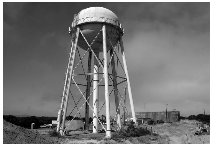
The E Reservoir (pictured above), which provides water pressure for the upper part of Fitch Park, will be replaced with booster pumps from a proposed D Reservoir. This work is part of storage-tank improvements at the site, which will serve residents in Seaside and Del Rey Oaks.

Rebates are no longer provided for older 1.6 gallon per flush toilets. For program details visit www.mcwd.org , or call the District’s Water Conservation staff at 883-5905.