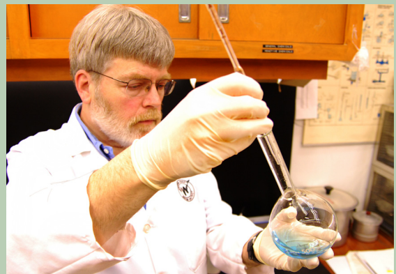
Laboratory staff continually monitor Marina's drinking water. Water quality data is posted monthly on the MCWD website ( www.mcwd.org ).