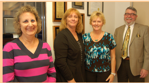
The District's Customer Service staff is available to assist you Monday through Friday, 8 AM to 5:30 PM.