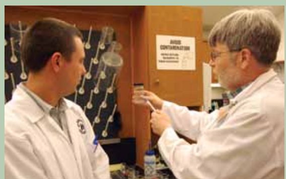
Laboratory staff continually monitor Marina's drinking water. Water quality data is posted monthly on the MCWD website ( www.mcwd.org ).