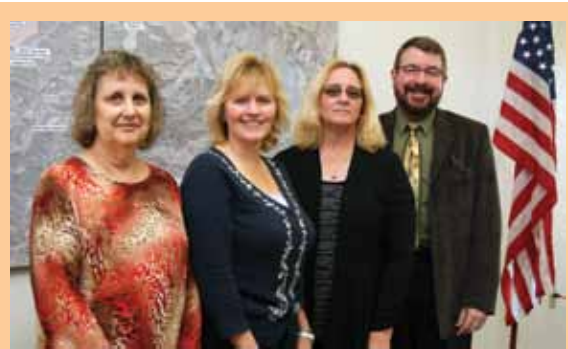
The District's Customer Service staff is available to assist you Monday through Friday, 8 AM to 5:30 PM.